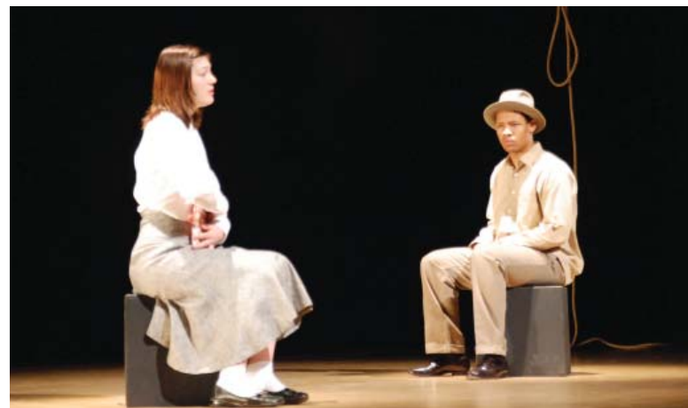
Anne & Emmett