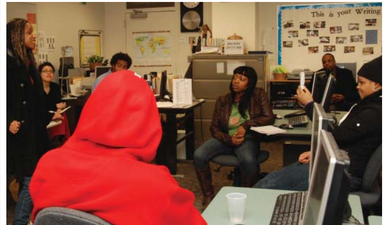
Open Mic